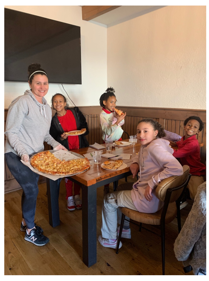
MASH Staff at Dayton Street Apizza.