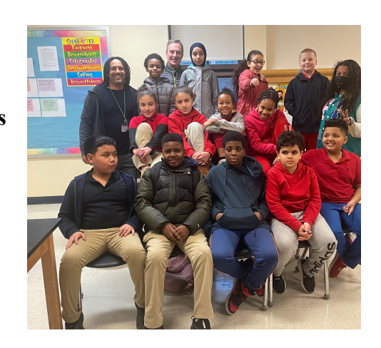
Staff of MASH News